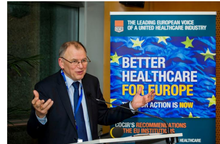
Vytenis Andriukaitis, Commissioner for Health & Food Safety

6 COCIR'S Recommendations For Eu Action To Improve Health