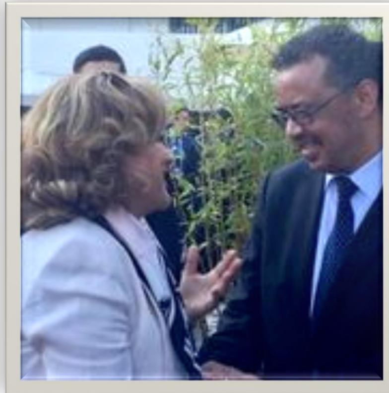
WHO Director General, Tedros Adhanom Ghebreyesus